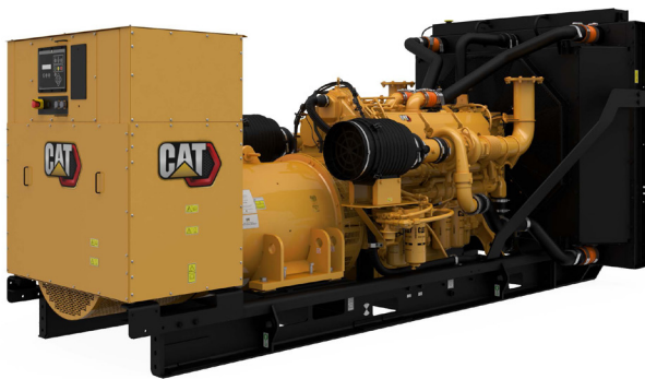
Image shown may not reflect actual configuration.