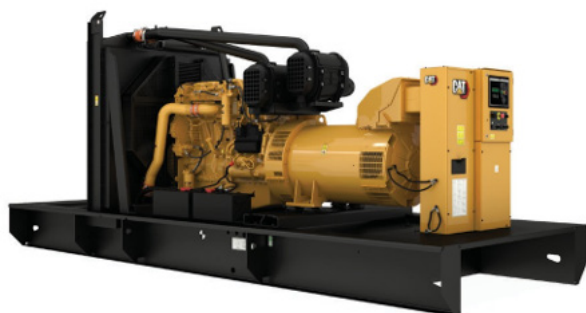
Image shown might not reflect actual configuration