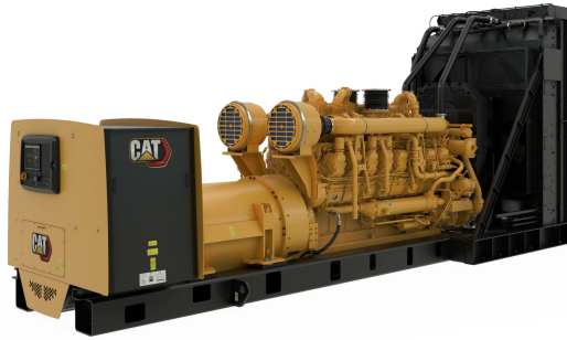
Image shown may not reflect actual configuration