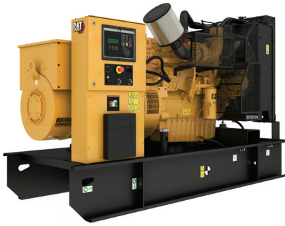
Image shown might not reflect actual configuration