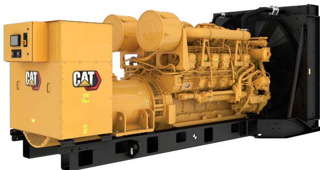
Image shown may not reflect actual configuration