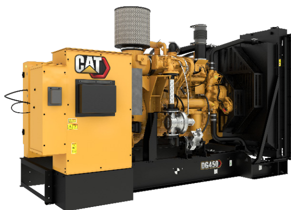
Image shown might not reflect actual configuration