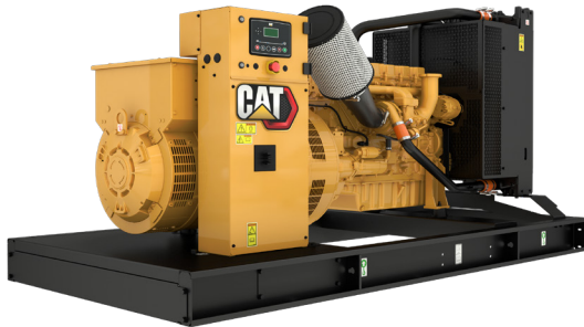
Image shown may not reflect actual configuration