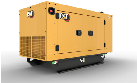
Image shown may not reflect actual configuration